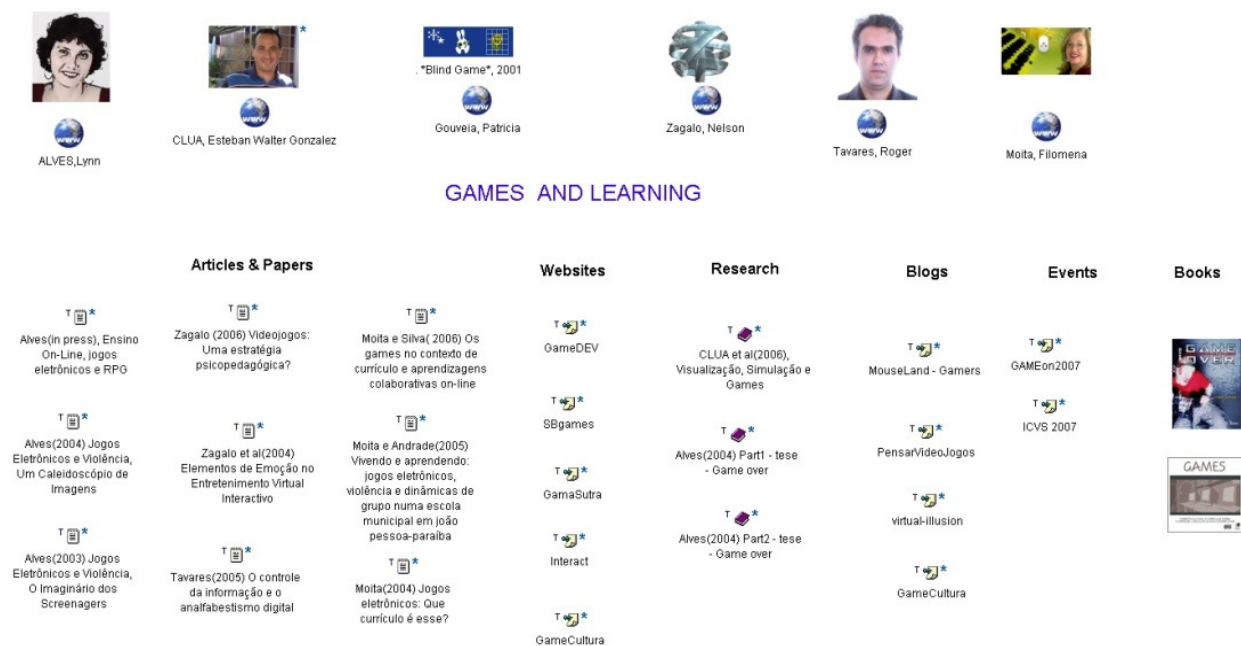
Figure1 Compendium Map about games and learning

Figure1 shows a reference map to support a discussion in FlashMeeting. Some participants interested in games and learning selected twenty five references using Compendium and classified in articles (9), websites (5), research(3), blogs(4), events(2) and books(2). They shared this map in the OpenLearn Community COLEARN and booked a FlashMeeting to discuss the uses of Games for Learning.